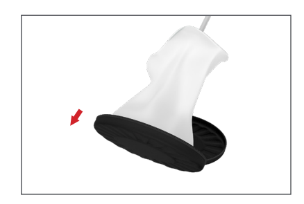
Step 8: Complete.