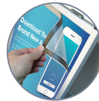
Magnetic sealed poster covers.