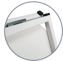
Hidden poster cover release hole in back panel.