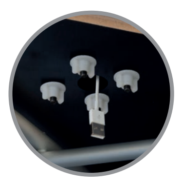
Feed USB end of charge/sync cable through middle of enclosure, below pin, so it protrudes from underside of counter/table top.