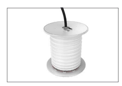
optional Rechargeable Lithium-Ion