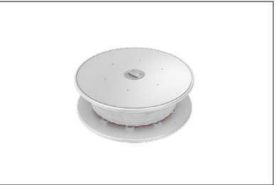
Step 5: Insert air pump and pump inner core until fabric graphic is tight. Note: Do not leave unattended and overfill.