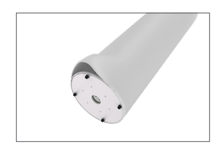
Step 8: Repacking. Deflate the tower and leave the fabric graphic attached to the tower.

Step 4: Repeat this process to install graphic on bottom of counter.