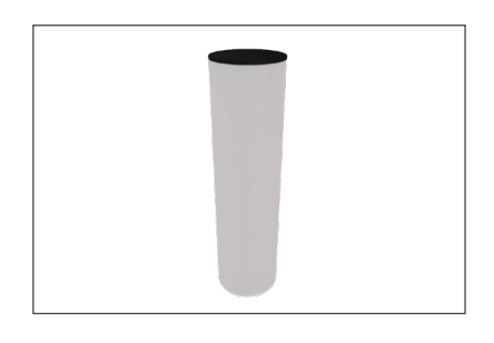
AIR LOSS THROUGH VALVE: The most common reason for loss of air is the valve has not been properly closed or was accidently opened with the pump nozzle during inflation. To close air valve press down on valve and turn left or right to closed position. To open air valve and deflate the counter, press down on valve and hold. To keep open, press down and turn valve left or right to open position.

on top of the counter board until securely fastened all around.