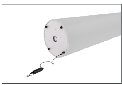
Step 6: Connect Power Supply or Battery.