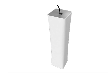
WARNING: To avoid breaking or damaging the top or bottom edge groove of your display, lower gently onto ground when assembling and disassembling. Do not drop tower or tip over any time.

Step 8: Repacking. Deflate the tower and leave the fabric graphic attached to the tower.