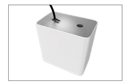
WARNING: To avoid breaking or damaging the top or bottom edge groove of your display, lower gently onto ground when assembling and disassembling. Do not drop counter or tip over any time.

Step 8: Repacking. Deflate the counter and leave the fabric graphic and countertop attached to the display.